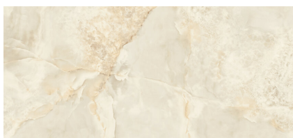
ARAL CREAM PULIDO XL2612P