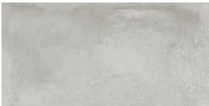
INDUSTRIAL HALL LIGHT GREY P6012L