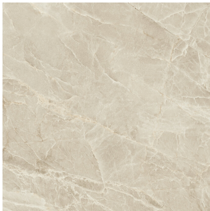
MAJESTIC CREAM SILKY P1212LB