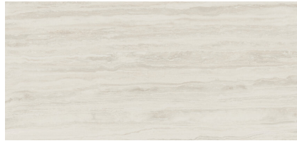
PALATINUM BONE XL2612L