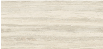
PALATINUM BEIGE XL2612L