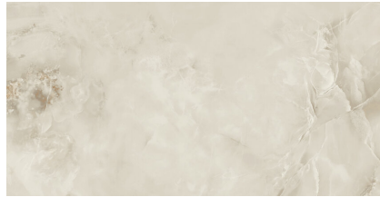
RAPSODY CREAM PULIDO PS6012P