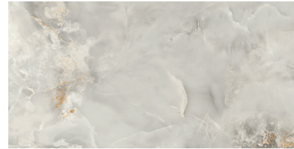
RAPSODY GREY PULIDO PS6012P