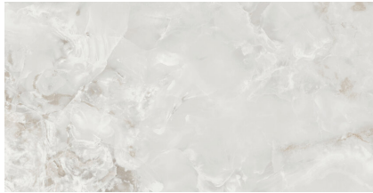
RAPSODY WHITE PULIDO PS6012P